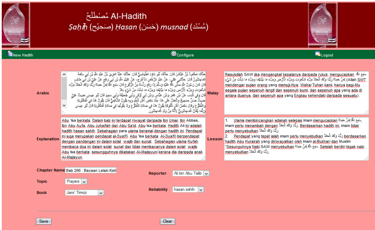
Fig 4: al-Hadith Compilation System User Interface

al-Hadith text, the user can save the data into the database. Messages are displayed to the user to confirm if data has been saved successfully. Measures are put in place to ensure that the user does not save the same al-Hadith twice. For this user interface, JavaServer Pages (JSP) technology was used to create dynamically generated web pages. The application logic is implemented using java beans (java classes).