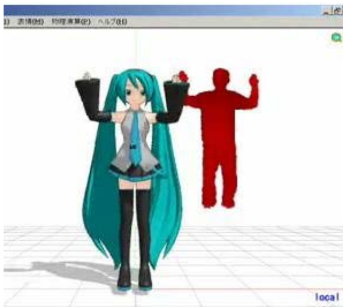
Fig. 2: MMD program with Kinect plug-in

Mikumikudance, commonly abbreviated to MMD, is a free animation program for novice animators to create 3D animations. This program has been popular among young people for its easy and quick implementation. With the advent of Kinect, a plug-in is made and expanded by Mr. Mogg to get the motion of neck, wrist, upper body, lower body, and ankle in MMD Kinect motion capture. Instead of manually manipulating joints, animators can make use of Kinect plug-in to do a quick 3D animation by acting out. Figure 2 is a screen capture of a 3D model mapping the movements of the user (the red man).